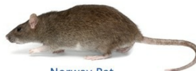
Norway Rat 7-18oz 13-18" long