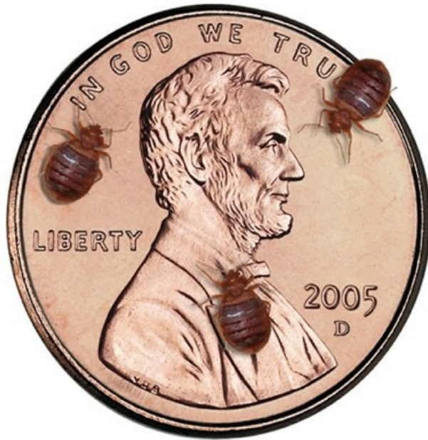
The size of an adult bedbug compared with a US penny

Bed bugs are tiny and vary in size based on their stage in the life cycle. Immature, or nymph, bed bugs range from 2-5 millimeters in length while fully grown adult bed bugs are a quarter of an inch long or larger, generally the size of an apple seed.