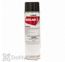
DoMyDIY Bedlam Insecticide Aerosol $24.97 ★★★★★ (137)