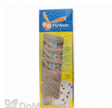
Flyweb Fly Light $44.31