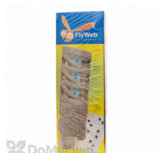
Flyweb Fly Light $44.31