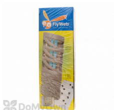
Flyweb Fly Light $44.31