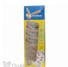
Flyweb Fly Light $44.31