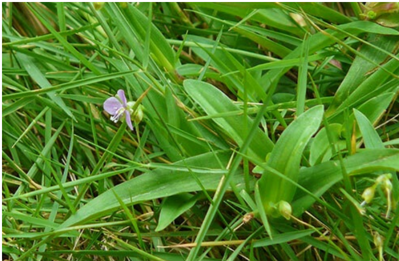
"Murdannia nudiflora (L.) Brenan"

Doveweed grows low to the ground and can be overlooked among certain turfs -especially centipedegrass or St. Augustinegrass. Doveweed stems may grow as tall as 12 inches, but are usually not visible in that manner. The stems tend to form mats as the creeping stolons spread and produce more root-forming nodes.