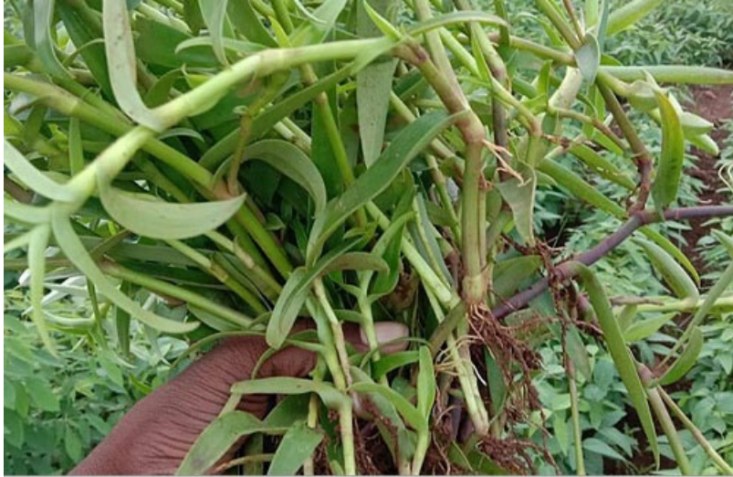
AjayLab 2021, CC BY-SA 4.0. Cropped.

Doveweed can be a very stubborn weed once it has infested a piece of turf. Multiple applications of post-emergent herbicides labeled for use with doveweed may be required to completely control doveweed that is already established on a property. Applying a pre-emergent herbicide that is labeled for doveweed earlier in the season can also help keep a doveweed outbreak from spreading.