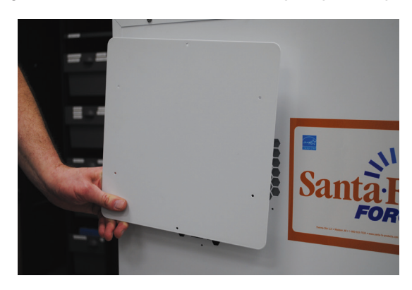
Step 5: Attach duct plate to side of dehumidifier using 6 screws. This will direct all exhaust air to the side with the duct collar attached. If attaching collars to both exhaust outlets, skip step 5 and proceed to step 6.