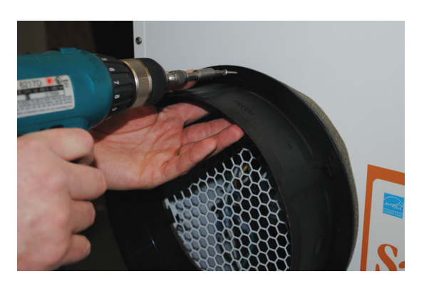
Step 4: If attaching duct collar to both exhaust outlets, repeat steps 2-4 for the opposite side. If only using one exhaust outlet, skip step 4 and proceed to step 5.