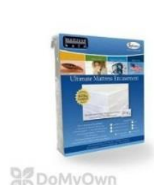
Mattress Safe Sofcover Mattress Encasement