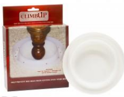
ClimbUp Insect Interceptor