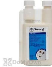
Temprid SC Insecticide