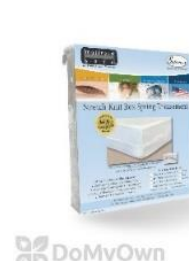
Mattress Safe Stretch Knit Box Spring Encasement