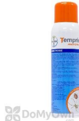
Temprid Ready Spray