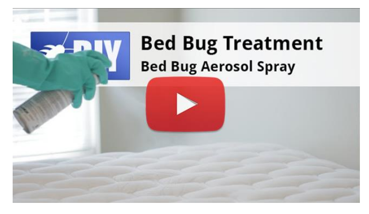
Bed Bug Treatment Video Available on DoMyOwn.com

Bed bug aerosol sprays come with a straw applicator to make it easier to apply into the cracks and crevices of furniture and mattresses around the affected rooms. Don't forget to apply in drawers, picture frames, bed frames, and any other cracks you can find. You will want to allow this part of the treatment to dry before moving on.