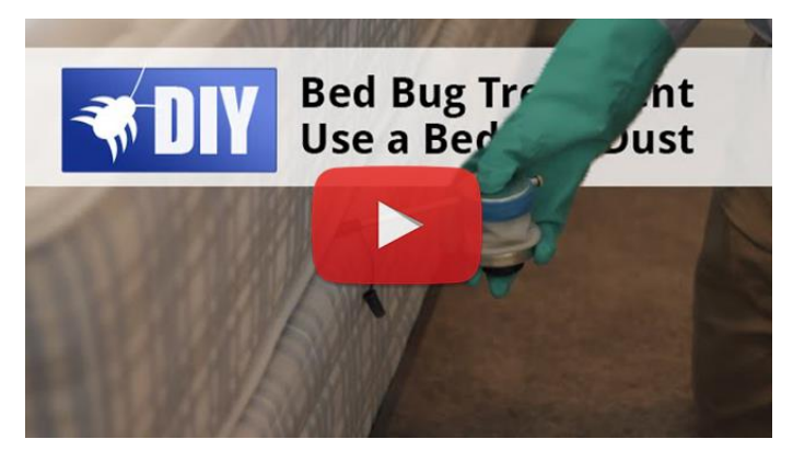
Bed Bug Treatment Video Available on DoMyOwn.com