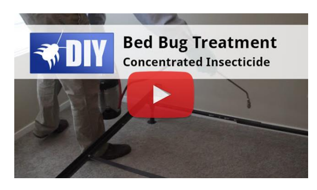
Bed Bug Treatment Video Available on DoMyOwn.com

Repeat as needed. Be sure to read the product label for how often you can safely reapply.