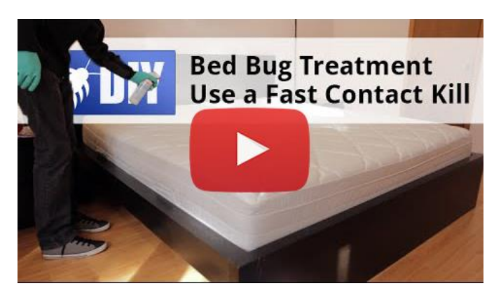
Bed Bug Treatment Video Available on DoMyOwn.com