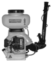
Microniseur B 245