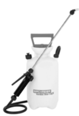
Garden Star 3