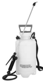
Garden Star 5