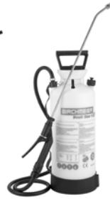
Profi Star 5