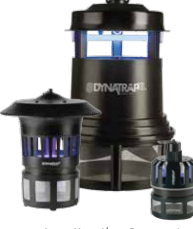
Learn More About Dynatrap At www.dynatrap.com

Long Term Relief is Maintained with Continued 24/7 Operation.