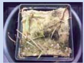
15 days after treatment

For optimal control, a second application may be needed 14 to 20 days after initial treatment.