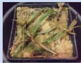
10 days after treatment