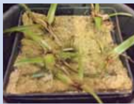
5 days after treatment

The doveweed images to the right demonstrate the type of dramatic results you can expect just days after a single treatment with Blindsight.