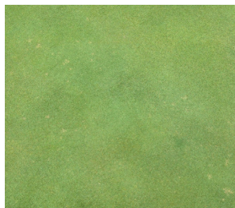
Daconil Ultrex 2.5 oz. /1000 Primo Maxx 0.125 fl. oz. /1000 Fungicide Activator Select