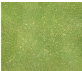
Daconil Ultrex 3.25 oz. /1000 Primo Maxx .125 fl. oz. /1000