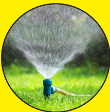
STEP 2: Water in