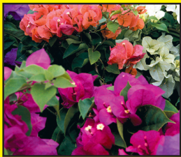
FLOWERS AND ORNAMENTALS

*May not be applicable to all soil types. Contact your local Cooperative Extension Service Office for recommendations regarding soil in your region.