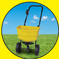
STEP 1: Apply with any spreader

A great result is a lawn or garden that is the envy of the neighbors. HI-YIELD® FAST ACTING GYPSUM® is the stress free way to get there. When you apply HI-YIELD® FAST ACTING GYPSUM® , you are doing more than giving your lawn and garden calcium and sulfur. You are also helping to improve the overall soil structure and helping to loosen compacted soils*. Better air and water penetration promotes root development and heartier plants. It is the worry free way to a beautiful lawn or garden.