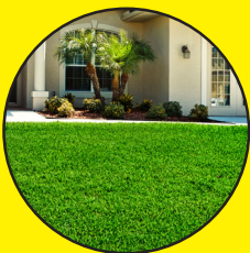
STEP 3: Enjoy results

HI-YIELD® FAST ACTING GYPSUM® is one of the best things you can do for your lawn or garden. It can help to loosen compacted soils which in turn promotes root development*. It also adds calcium and sulfur to your soil, two essential elements. HI-YIELD® FAST ACTING GYPSUM® will not affect soil pH. AST® helps to reduce sediment loss and helps to condition soils creating a better environment for growth.