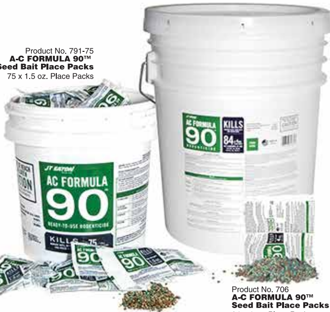
Product No. 706 A-C FORMULA 90 TM Seed Bait Place Packs 84 x 4 oz. Place Packs