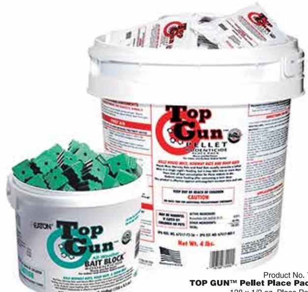
Product No. 750 TOP GUN TM BAIT BLOCKS ® 128 x 1/2 oz. Blocks