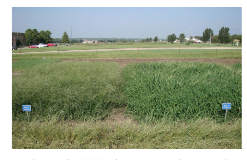
Ardmore, OK 2012. Plots sown on the same day

Mojo now contains Impact™ (Right), a variety released from the Noble Research Institute that heads out 14 days later than Red River (Left).