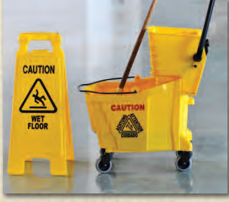
Using Nibor-D as a mop solution