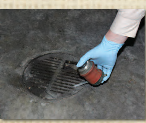
Dusting Nibor-D in drains