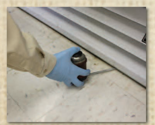
Dusting Nibor-D under refrigerator