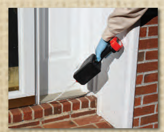
Dusting Nibor-D under along windows