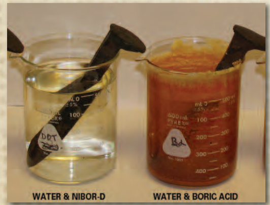
Nibor-D vs. Boric Acid Corrosion Comparison