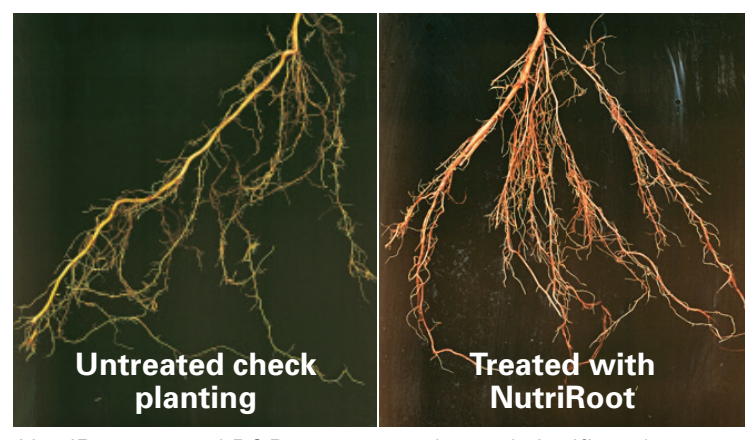
NutriRoot-treated B&B pear trees showed significantly more new root growth than untreated check plantings