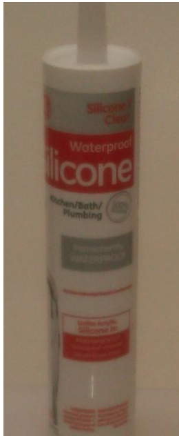
Tube of Clear, Waterproof Bath and Tile Silicone / Putty Knife

This is a fast and cost-effective method of sealing these porous surfaces