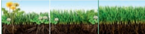
1 ANNUAL FEEDING 2-3 ANNUAL FEEDINGS 4 ANNUAL FEEDINGS