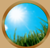
Grows in full sun

Scott's® EZ Seed® is a revolutionary seeding mix that takes care of the seed for you, so you can grow thick, beautiful grass ANYWHERE!*