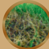
Helps protect seedlings against disease