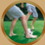
Survives wear and tear