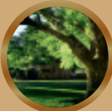
Grows in dense shade