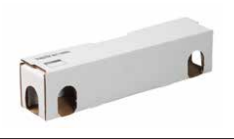
2158 MS TUNNEL

4.5"D x 2.5"H x 9"W 50/cs 8lb. Holds mouse glue board and up to three mouse snap traps.