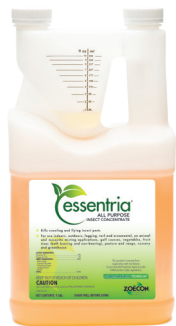
Essentria® All Purpose Insecticide Concentrate Botanical insecticide