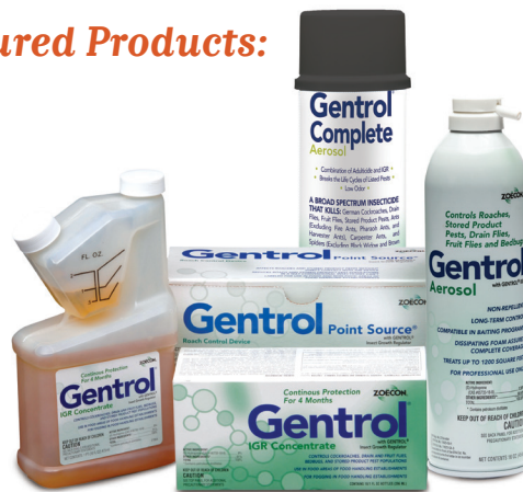
Gentrol® Family - Aerosols, Concentrate, and Point Source Synthetic insect growth regulators