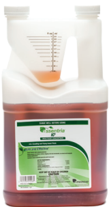
Essentria® IC-3 Botanical insecticide