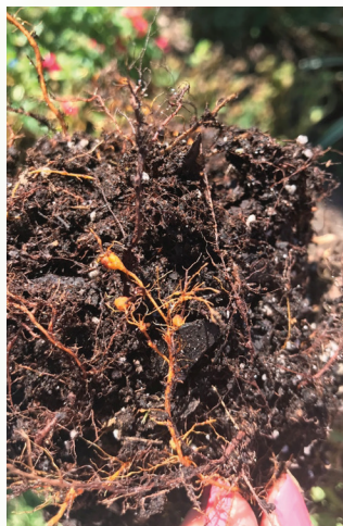
Source: Root-knot nematode galls on Pentas

Routine scouting should include examination of the foliage, as well as soil and root sampling in problem areas, with samples sent to a diagnostic lab to identify nematode species and population densities. Plants and areas of the greenhouse/nursery determined to be at risk can be treated preventatively with Trefinti nematicide/fungicide for control of nematodes.