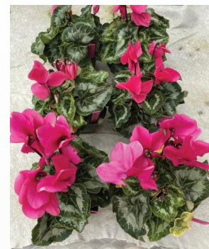
Trefinti® nematicide/fungicide 6 fl. oz./100 gal.