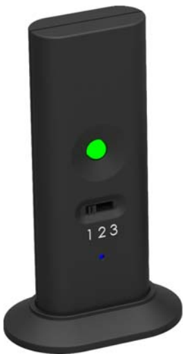
Receiver unit Size: 1.5" wide x 3.5" high x .5" thick

With just 2 screws and less than 2 minutes, anyone can add the W.A.R unit to their RT-100!