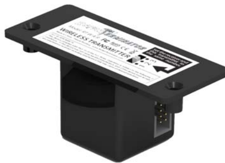
The transmitter unit fits perfectly in the electronics compartment of a Wireless Ready RT-100.