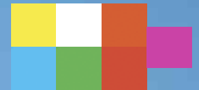
7 COLORS: Yellow, White, Orange, Blue, Green, Pink & Red