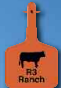
Custom marking available.