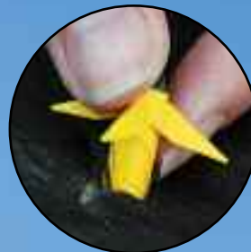
Small piercing hole