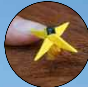
Tag tip blunted during application