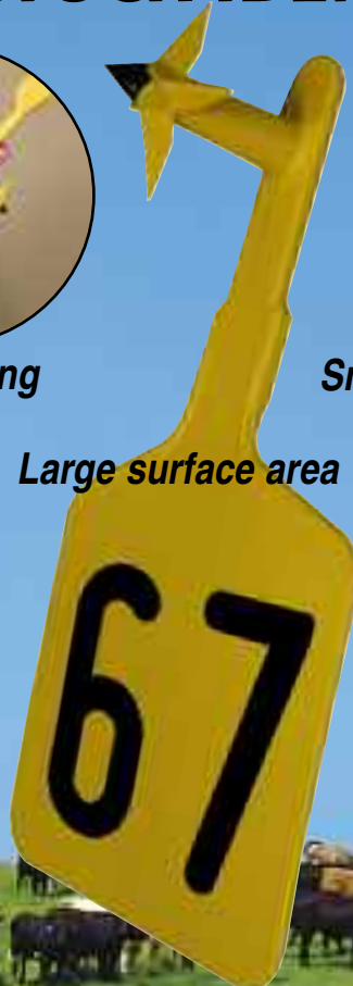
Large surface area