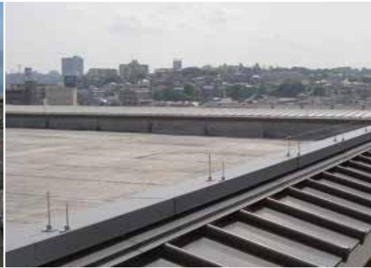
Two rows of Birdwire on this parapet cap provides low visibility protection from pigeons and large birds.