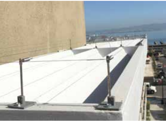
Birdwire, mounted with Glue-on-Bases screwed into this metal structure repels pigeons.