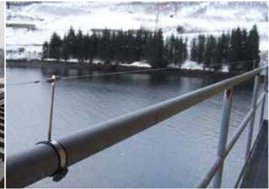
Railing clamps are attractive and easy to use on pipes and hand rails.