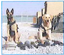
Military K-9's in Afghanistan wearing ChillyDog® vests donated by Glacier Tek.

CoolARMOR® — the first and only phase change cooling accessory designed specifically for use with ballistic armor. Having made numerous cooling inserts for a variety of body armor companies for several years, we developed our own product that provides cooling for a law enforcement person who can not wear a complete CoolVest. CoolARMOR® fits comfortably under most body armor without limiting critical movements during weapons use and physical alterations. All components can be easily decontaminated in the event of contact with bodily fluids.