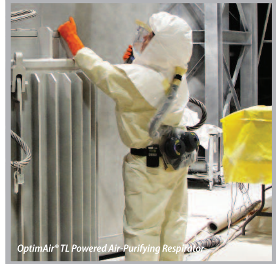
OptimAir® TL Powered Air-Purifying Respirator