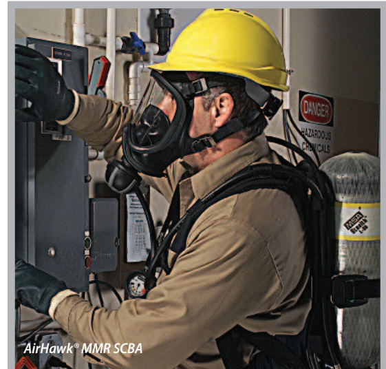
AirHawk® MMR SCBA

Because it is sometimes not practical to maintain engineering controls that eliminate all airborne concentrations of contaminants, proper respiratory protective devices should be used whenever such protection is required.