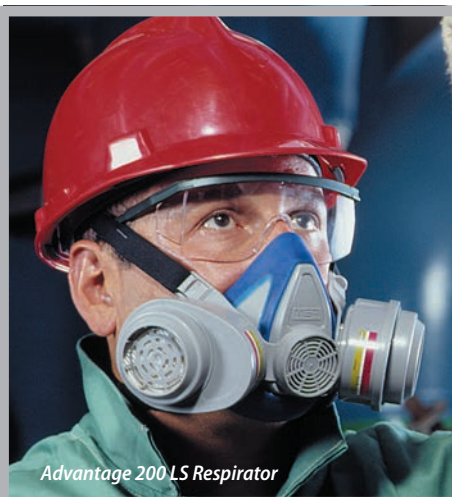
Advantage 200 LS Respirator