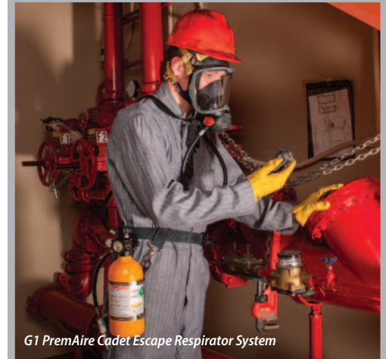
G1 PremAire Cadet Escape Respirator System