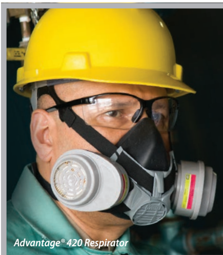
Advantage® 420 Respirator

Organometallic Compounds —These are generally comprised of metals attached to organic groups. Tetraethyllead and organic phosphates are examples.