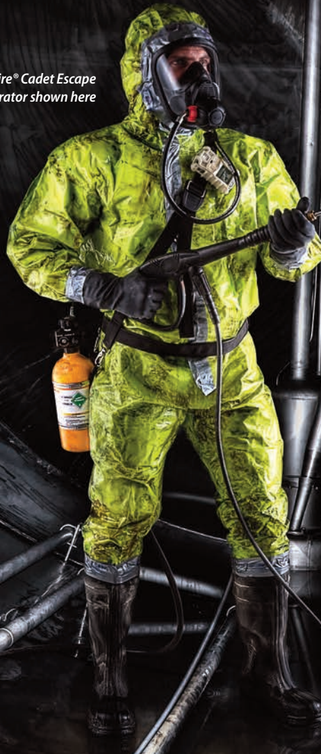
PremAire® Cadet Escape Respirator shown here

OSHA (the Occupational Safety and Health Administration) and NIOSH (the National Institute of Occupational Safety and Health) regulations define all the specific requirements which must be followed, including the capabilities of appropriate respiratory protection. Employers must follow the requirements of these governmental regulations, both the general regulations which apply to all workplaces and the specific regulations for exposures in their particular industry, such as lead, silica dust, asbestos, and ammonia.