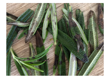
Xanthomonas on rosemary