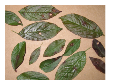
Prunus bacterial shothole