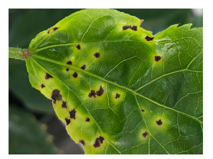
Pseudomonas on hibiscus