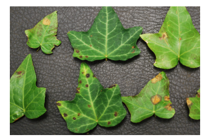
Xanthomonas on ivy