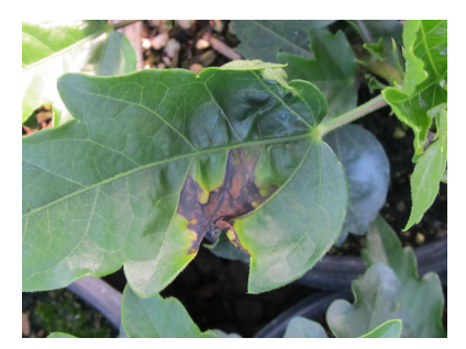
Xanthomonas on hibiscus