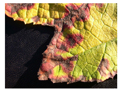
Xanthomonas on oak leaf hydrangea