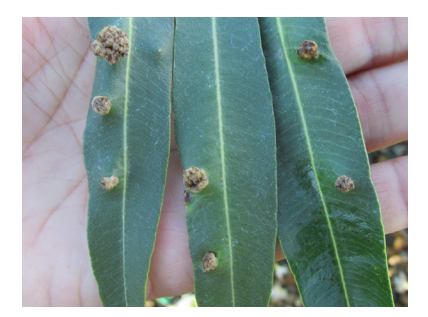
Pseudomonas olive knot on oleander