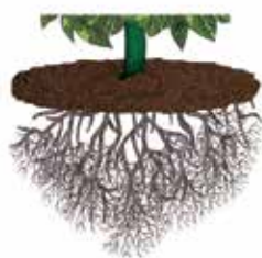
Roots With Biozome