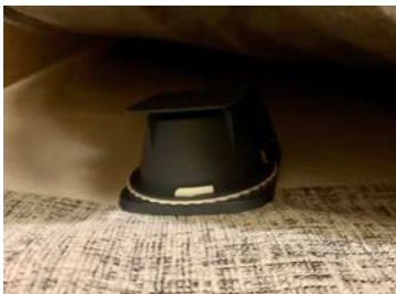
Placement between mattresses and by the legs of the bed

Place trap on firm surface with good light, remove the cone, inspect inside and outside for bed bugs